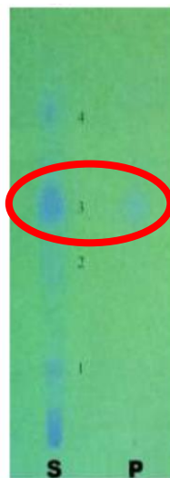
Figure 2. Chromatogram. (S) Black garlic extract; (P) s-allylcysteine